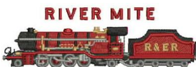
The Ravenglass and Eskdale Railway Preservation Society