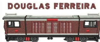
The Ravenglass and Eskdale Railway Preservation Society