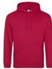
Red hot chilli