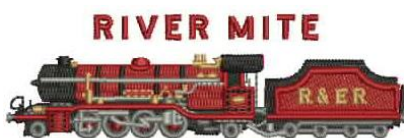
The Ravenglass and Eskdale Railway Preservation Society