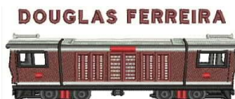
The Ravenglass and Eskdale Railway Preservation Society