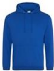
Bright Royal blue