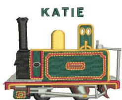
The Ravenglass and Eskdale Railway Preservation Society