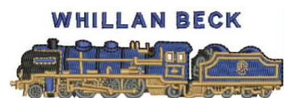
The Ravenglass and Eskdale Railway Preservation Society