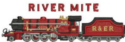
The Ravenglass and Eskdale Railway Preservation Society