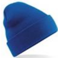
Bright Royal blue