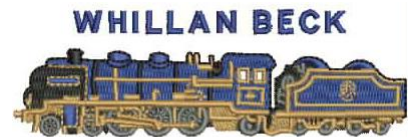
The Ravenglass and Eskdale Railway Preservation Society