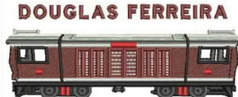
The Ravenglass and Eskdale Railway Preservation Society